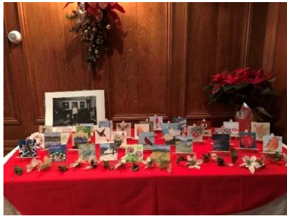
Art Swap at Endicott Estate, 2018

Let's kick off the New Year by creating a "virtual" Art Quilt! We aren't able to enjoy our annual December "Art Swap" in person. Instead, please celebrate the New Year by creating miniature artworks on your own and submitting JPEGs to exhibit as an online Art Quilt.